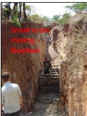
Small scale mining - Busolwa