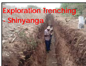
Exploration Trenching - Shinyanga