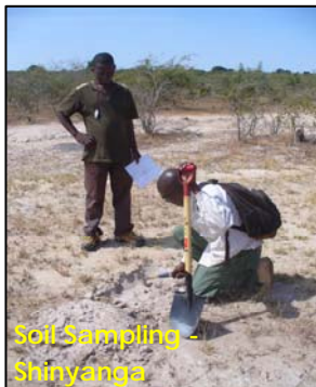
Soil Sampling - Shinyanga

Obtala plans to use a number of strategies to enhance Shareholder value such as developing mineral licence assets using its own team, development in partnership with other groups or by way of disposal of mineral licence assets where appropriate. Furthermore, the Group will continue to evaluate opportunities to acquire additional assets at the exploration, development and production stages both in Tanzania, and globally.