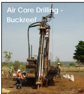
Air Core Drilling - Buckreef